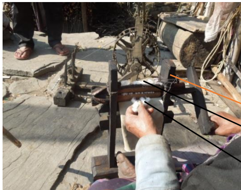
Seeds Cotton Krishing